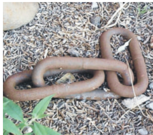
THE MISSING LINK: All that remains of the coupling

THIEVES have helped themselves to a sentimental heavy-duty railway chain-coupling in Wolverton.