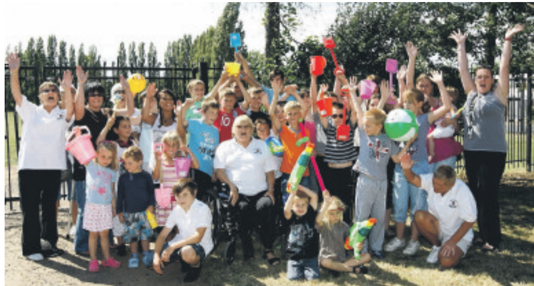
ALMOST STRANDED: Lakes Estate summer scheme has been 'saved' but others are not so lucky

Those affected should write to Robert Day & Company at The Old Library, The Walk, Winslow, Buckinghamshire, MK18 3AJ.